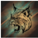
Image Lynx ROES

First Order FREE! (See Display for details)